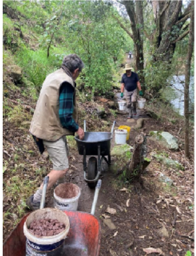
Upgrading the track surface