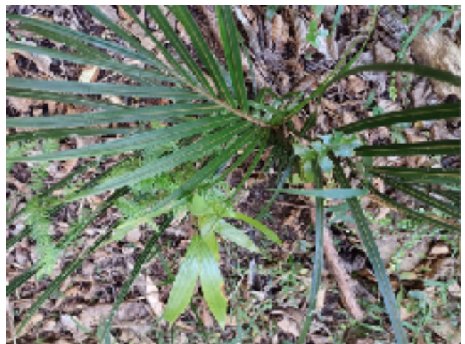
The faster growing bangalow palm (light green) will out compete the slower growing native nikau