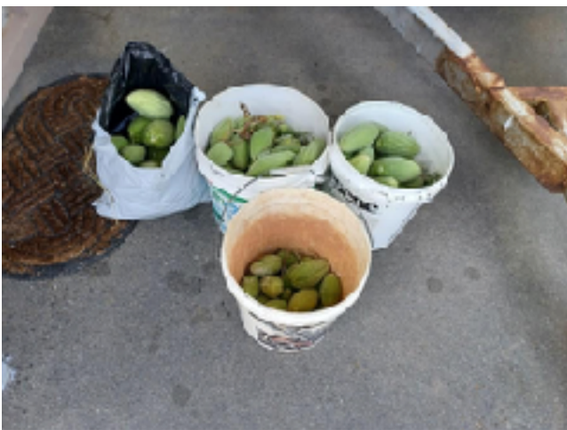
Moth plant pods removed from Mill Lane extension